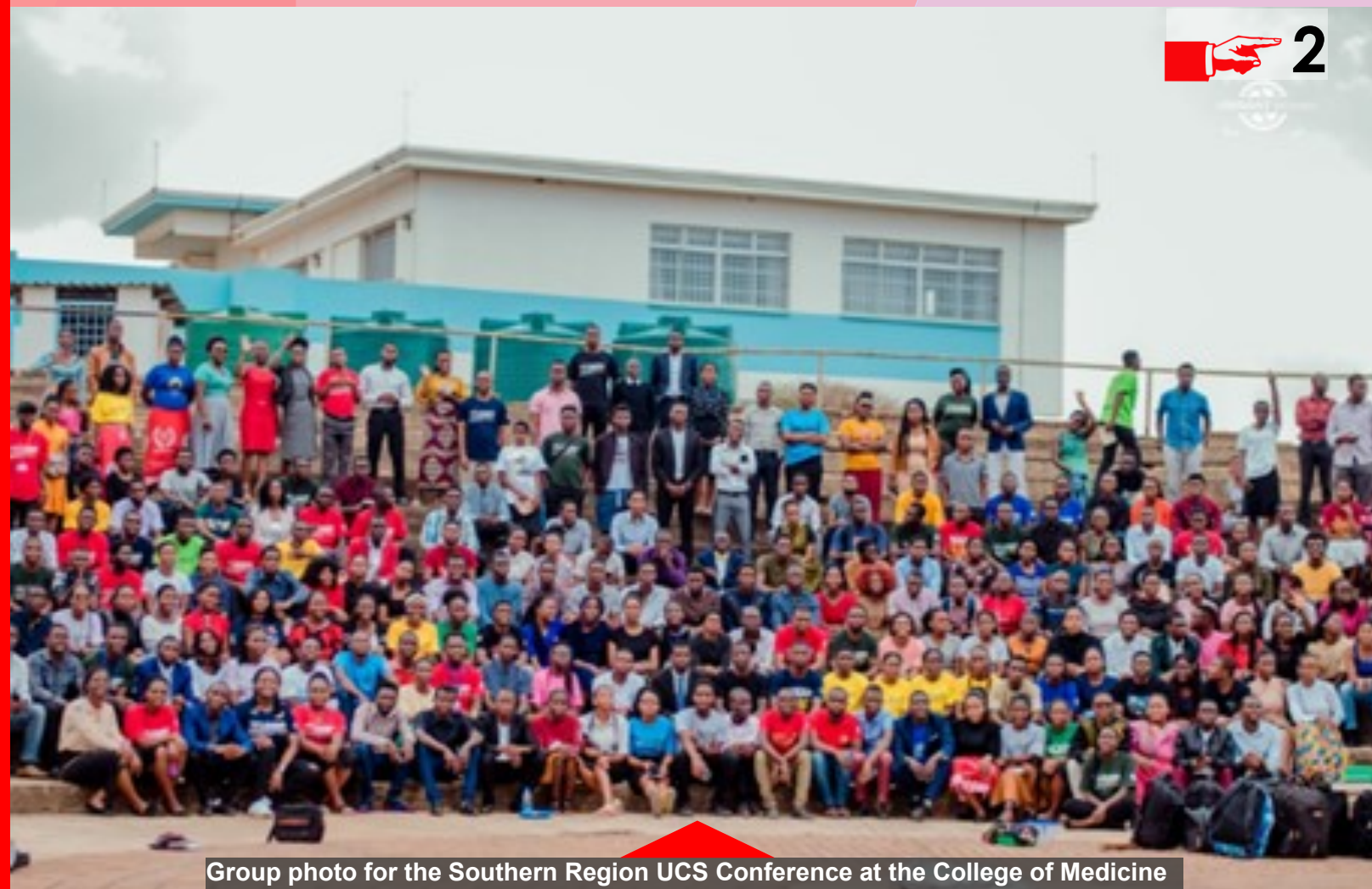
Group photo for the Southern Region UCS Conference at the College of Medicine