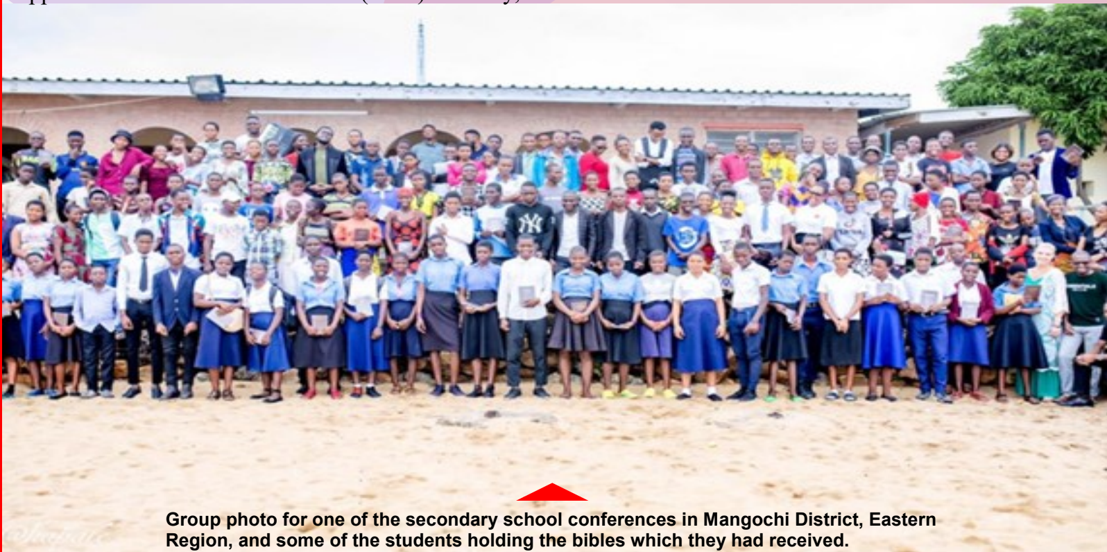
Group photo for one of the secondary school conferences in Mangochi District, Eastern Region, and some of the students holding the bibles which they had received.

During the secondary schools, 1745 students received New Testament Bibles (with Psalms and Proverbs), courtesy of the Bible Society of Malawi (1000 bibles) and Gideons International (745 bibles). The Bibles came at the right time considering that most of those who had committed their lives to Christ did not have bibles of their own.