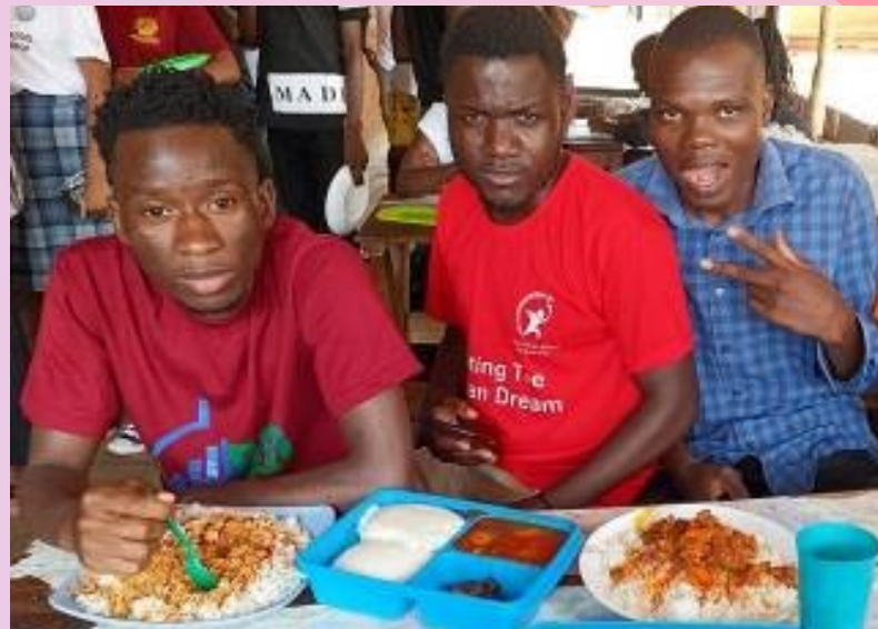
Some of the meals beneficiaries take their meals at the designated restaurant