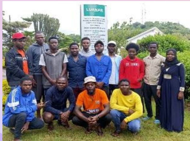
Some of the beneficiaries take a photo on campus