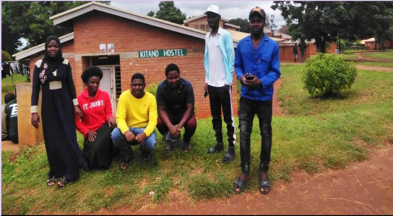
Some of the accommodation beneficiaries, pose for a photo