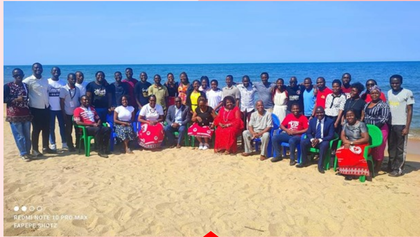
Some of the graduands pose for a photo with the facilitators, at Nkhotakota Safari Lodge (26 August, 2023)

In July and August, 2023 SCOM held 20 school leavers' retreats in the Northern, Central and Eastern Regions, and one graduands retreat, respectively. School Leavers' Retreats are meant to prepare students who are finishing secondary school and tertiary education for the life ahead in terms of career paths/progression, relationships and marriage, and how they can stand firm in the faith regardless of the pressures they may face. These retreats are also used as a platform for recruiting Associates into the SCOM Associates Fellowship, as such, one of the areas of discussion is about SCOM and how they can be part of the movement. 1, 541 school leavers (688 M, 853 F), and 29 graduands (18 M, 11F) were reached during the school leavers and graduands retreats, respectively. Some have already joined the graduates' ministry and have been duly trained.