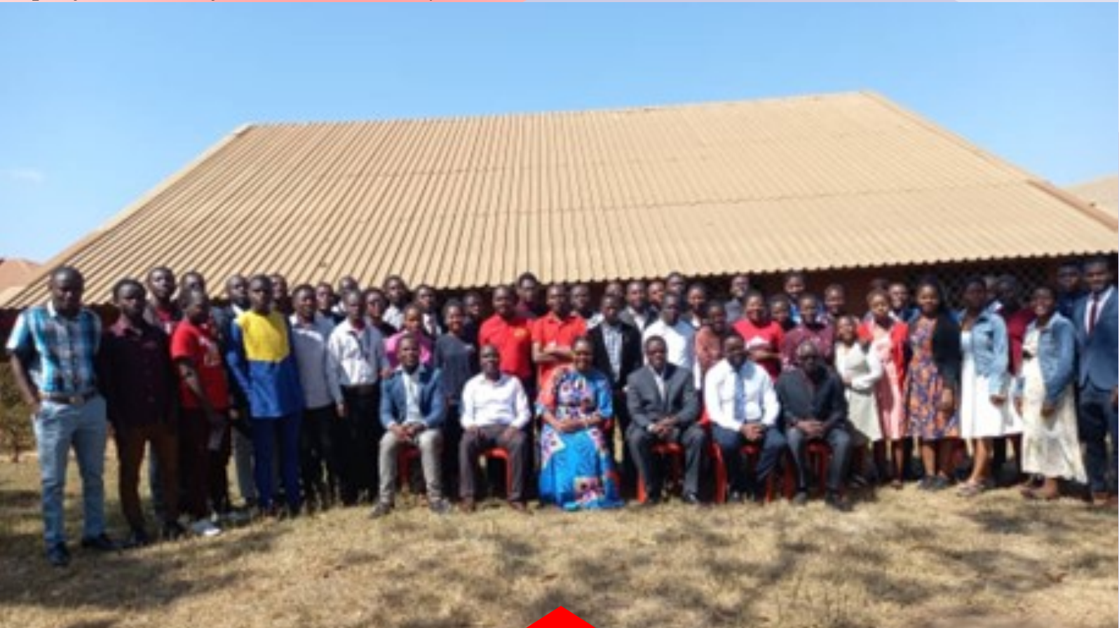
Group photo of student leaders with their facilitators