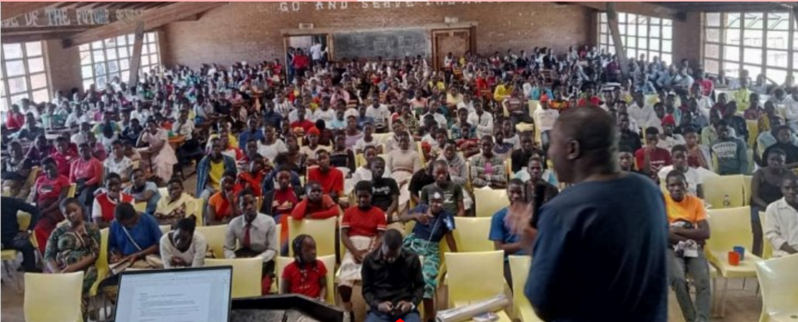
A presentation on academic excellence during the Ntcheu conference

Cost of all conferences was over MK150,000,000 and main sources of funds were SCOM associates contributions, students' registration and support from partners such as World Vision International (WVI), Reach Out for Christ (ROC), Operation Mobilization (OM), Future Vision and some churches. Much of the expenditure was on food which costed about half of the total budgets followed by venue charges (like accommodation) and others.