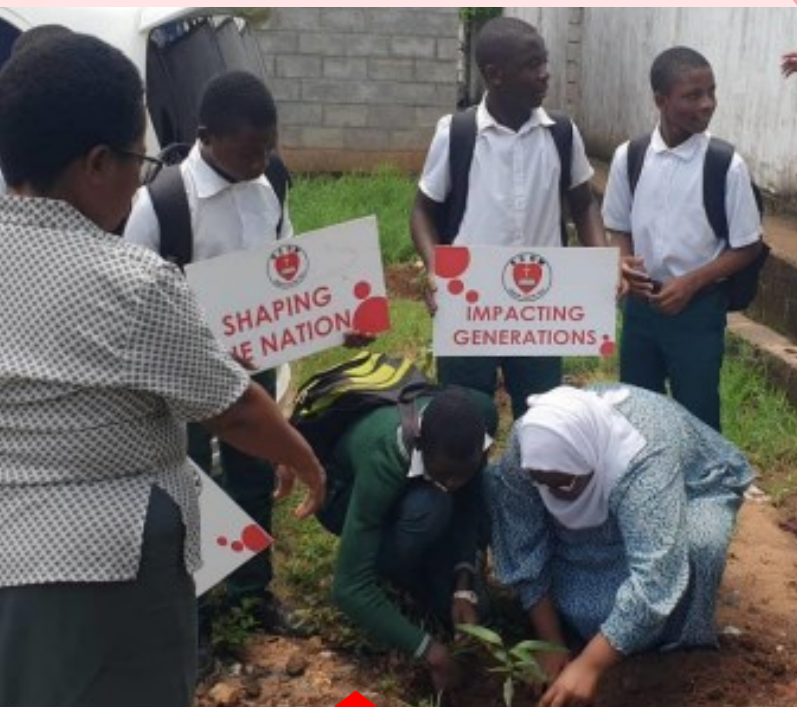
A teacher takes her time to get involved in the tree planting exercise

Headteachers in the schools where trees were planted were very thankful to SCOM for the initiative. During the planting exercise at Nchesi CDSS, the head teacher was happy to see that there were fruit trees among the seedlings. Taking a nutrition point of view, the headteacher said that children in the city do not easily have enough fruits unless they are bought from the market. Their school, she said, receive many less privileged students who, in future, will benefit from the fruits.