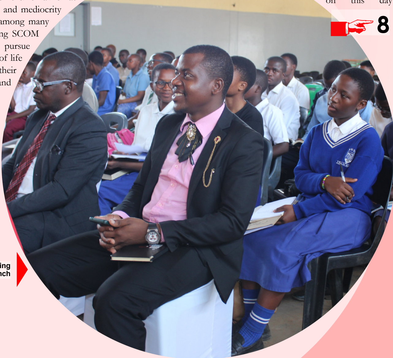
Part of the audience during the launch