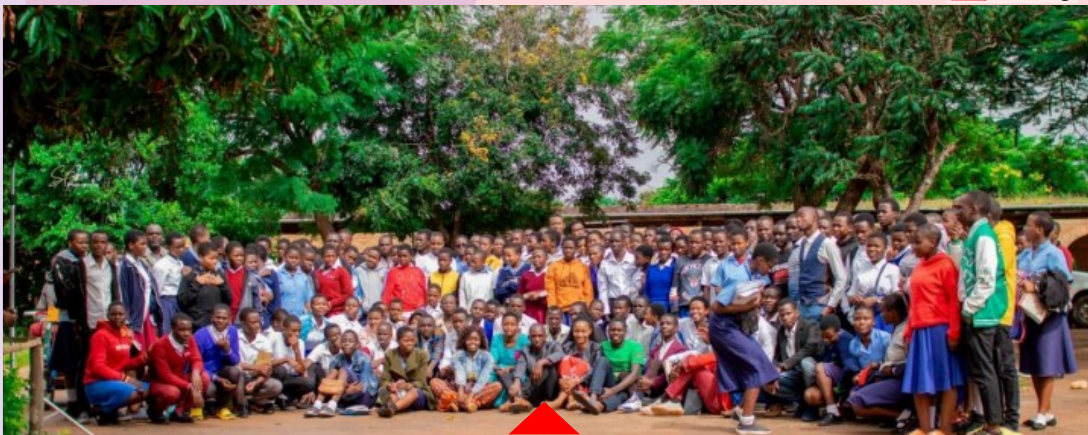
A group photo after the chitipa conference