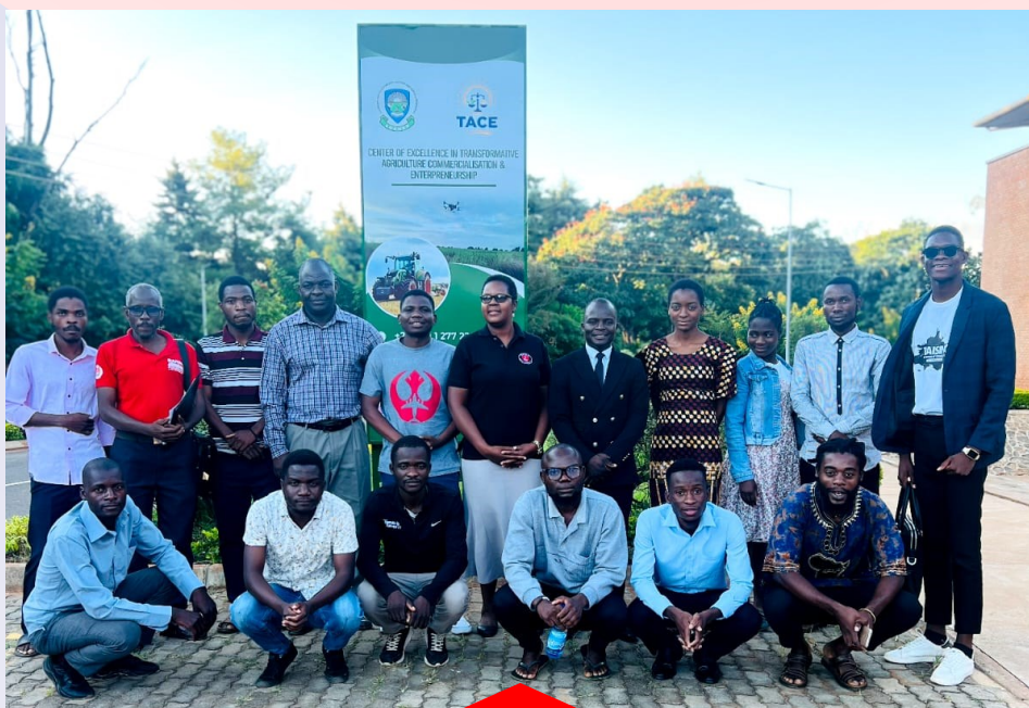
Group photo of some of the participants after the exit workshop