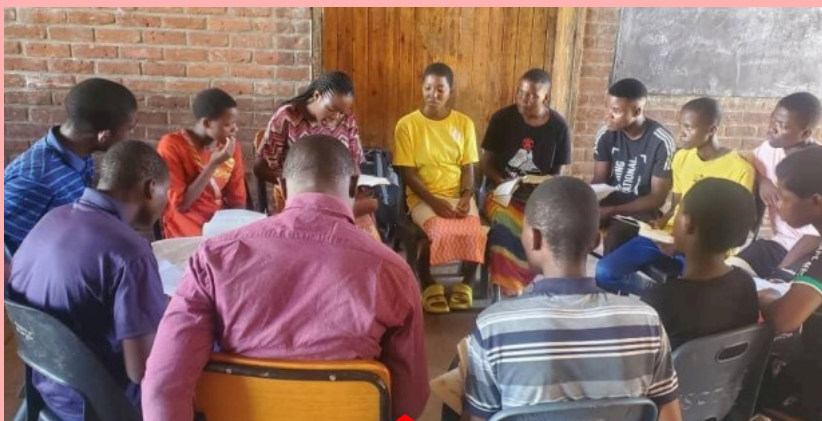
A Group Bible Study during the conference in Salima