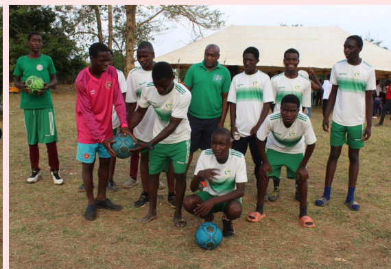
Various sporting disciplines were on the card in the afternoon