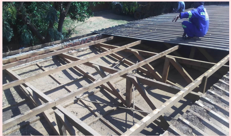
The SCOM office in Lilongwe under renovations with resources from the generosity month