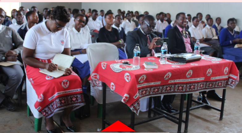
Part of the audience during the launch