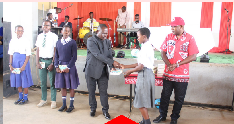
Guest of honor along with SCOM National Executive Committee chairperson distributing bibles to students