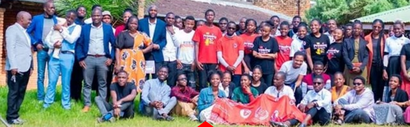
A group photo of some of the participants at the Northern Region UCS Conference

Between April and May, 2025, SCOM organized a total of 45 student conferences; 42 for the secondary school section which were held in different clusters across the country and 3 for the universities and colleges section which were held at regional level. The secondary school conferences reached to 13,409 students (5, 498 males, 7, 911 females) from 892 secondary schools across Malawi with over 3, 500 students who committed their lives to Jesus Christ as Lord and Savior. The Universities and Colleges Section reached 307 students in 3 of the 4 regions, and this